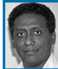
Danny Faure, VP and Minister of Finance, Pub. Admin. and ICT