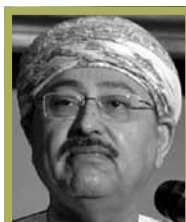
H.E. Maqbool bin Ali bin Sultan, Min. of Commerce & Industry

The country scrapped its two-tier tax system in January, so foreign enterprises are now taxed at a much lower rate. Investment incentives include various tax breaks and benefits; exemption from duties; loans on attractive terms for projects