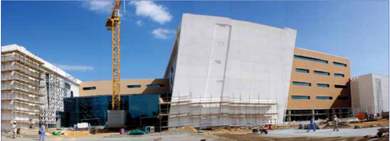
Construction is thriving in Oman, thanks to pioneering companies like Galfar Engineering and Contracting SAOG.

Sultan Qaboos bin Said. The country, which enjoys solid bilateral relations with the U.S. that include a free-trade agreement, saw its economy grow by 2% in real terms last year as it embraced industrialization and privatization.