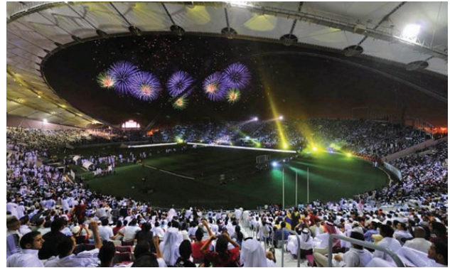
Qatar proposes a magical tournament.

Making this historic choice will ensure that every continent and region of the world has experienced the passion and excitement of hosting the World Cup. But we think the stakes are even higher than that. We believe that a World Cup in Qatar will offer people a new perspective and a better understanding of the Middle East. That's what has really got me excited.