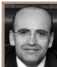
Mehmet Şimşek Minister of Finance