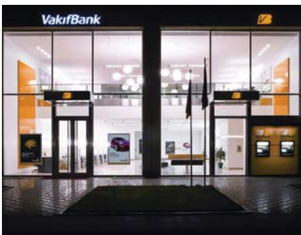
One of VakıfBank's new, modern and customer-focused branches.

Turkey's innovative approach of diversifying its products and markets has been a huge success. Two decades ago, it exported to 174 markets, a number that by 2008 had grown to 218. "There has been a strategy to diversify both products and markets," Finance Minister Mehmet Şimşek explains. "Trade with Africa and our neighbors has risen dramatically, and our regulations, institutions, and business practices are similar to Europe as we increasingly model Turkey on E.U. countries."