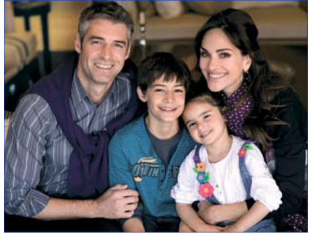
LC Waikiki, the fashion retail leader in Turkey. www.lcwaikiki.com

Counting many of Turkey's leading banks among its large number of blue-chip clients, IT solutions provider Servus enjoys a substantial market share as it helps firms cut operating