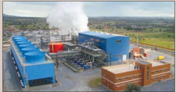
47.4 mwe/h Aydın-Germencik Geothermal Power Plant.

Founded in 1958, Güriş is now the umbrella organization for some 12 companies and nearly 6,000 workers. Its interests and portfolio include activities in such major infrastructure