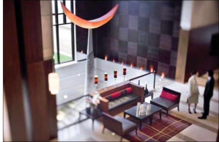
Mövenpick Hotel Istanbul, Turkey's leading business hotel. www.moevenpick-istanbul.com