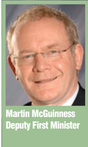
Martin McGuinness Deputy First Minister

excellent product for companies based in the U.S. for near-shore business solutions, and have a great deal to offer, thanks to a common language, a highly skilled labor market, and a potential tax regime that will boost investments in the financial, ICT, manufacturing, and biotech sectors. Corporation tax (currently 28%) is now going down and we are in discussions with the U.K.'s Chancellor of the Exchequer to adopt measures that will lower this level so that we can better compete in key sectors."