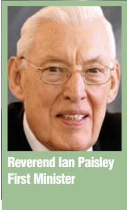
Reverend Ian Paisley First Minister