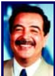
Jaime Nebot, Mayor of Guayaquil

In March 2006, Guayaquil was named 'Best City for Business' by Latin Trade magazine, reflecting not only the impact of the new tax incentives but the fact that Ecuador is a dollarized country, so investments in dollars are not subject to exchange rates and can be managed for long-term projects. Also cited were the city's legal security, its business-friendly administration, well-trained workforce and tourism potential.