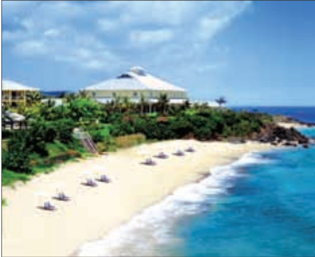
Martineau Bay Resort & Spa. www.starwoodhotels.com/martineaubay

With its new, $415 million, 20,000-capacity Convention Center, Puerto Rico hopes to become the international business center of choice for the Caribbean. The convention business already takes up 27% of the total hotel nights, so the island is already well set up to cater for the conference sector.