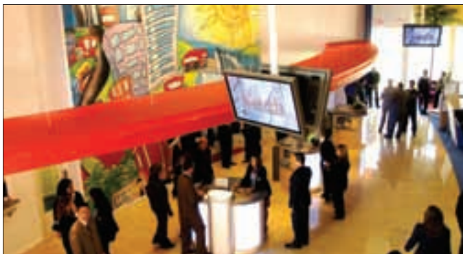
Westernbank's innovative branch has just opened in Condado, San Juan.