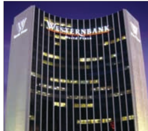
Westernbank Headquarters at the World Plaza building in San Juan's financial district of Hato Rey

EDB offers a range of loans and credit cards to benefit all sectors of