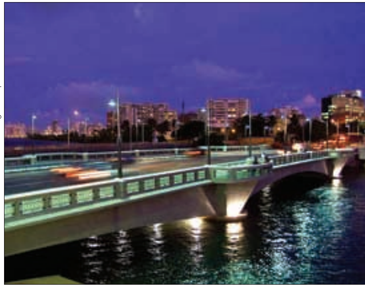
Puerto Rico is bridging the insurance gap