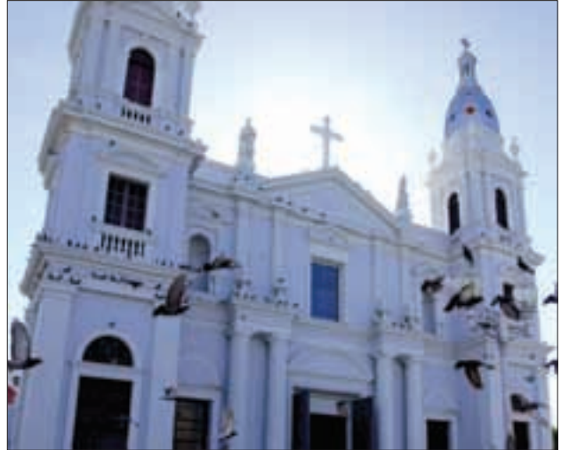
Ponce, more than you ever expected, "Come and discover us."